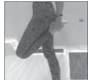
Alternate Quad Stretch

Leg Forward: Balance with one hand on wall; bend outside leg at knee; raise to 90 degrees if comfortable; extend the leg and lower foot to floor.